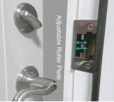
Adjustable Roller Plate

Compatible brands include: Schlage, Kwikset, Gatehouse, Baldwin, Brinks and Defiant. No dedicated hardware required.